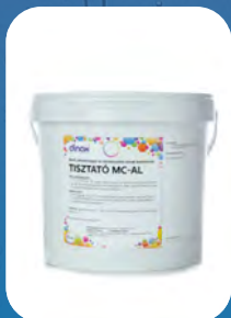
CLEAR POND MC-AL