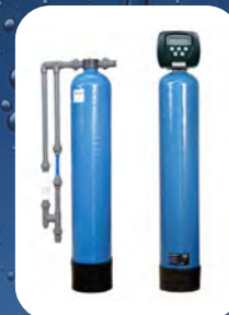
IRON-MANGANESE AND ARSENIC-FREE EQUIPMENT