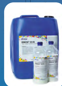
DRINKING WATER DISINFECTANTS