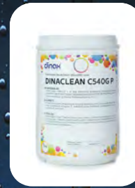
DINACLEAN C 540G P