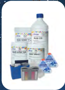
PACKAGES FOR POOLS