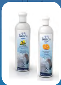
SCENTS FOR JACUZZI'S