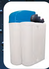
WATER SOFTENER EQUIPMENT