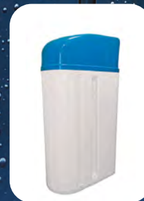
NITRATE REMOVAL EQUIPMENT