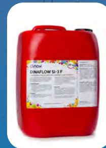
DINAFLW SI-3 F