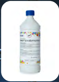
DINAX EDGE CLEANER F