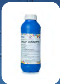
DINAX DESINETTE F