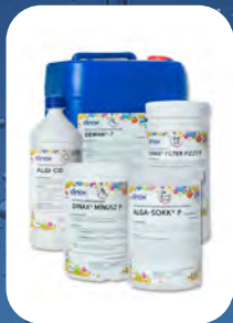
PACKAGES FOR JACUZZI'S